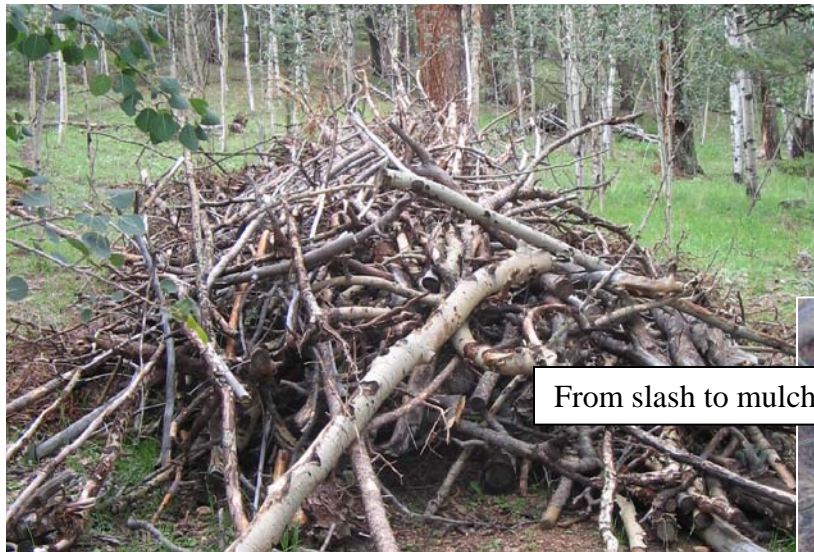
From slash to mulch